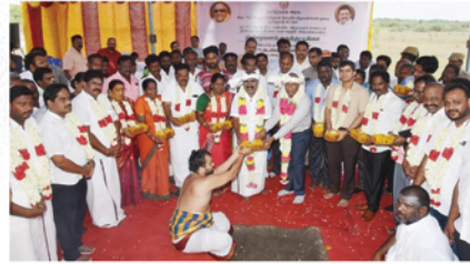
Foundation stone laid for pharma park at Tindivanam SIPCOT

The state-of-the-art park will come up on an expanse of 111 acres at an estimated cost of ₹55 crore; it will have a number of facilities including a common quality control testing centre, common effluent treatment plant, common water treatment plant and a library, as per a press release.